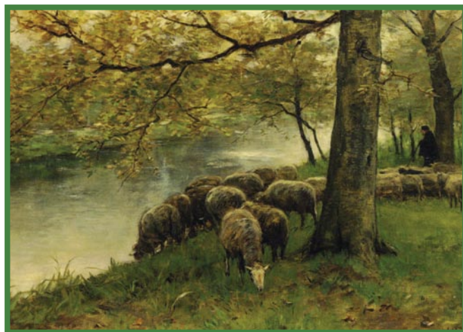
Anton Mauve: Sheep watering by a River